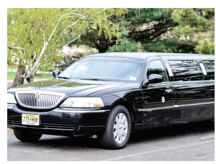
DiNovi & Associates Social Skills Limousine

We take a unique approach to social interaction and developing real world skills. Our specially designed and reinforcing limousines have been altered with our proprietary telehealth video technology to provide effective coaching and feedback directly to caregivers and clinicians. This service is available for qualifying individuals as a fun alternative to a school bus, and without the stigma.