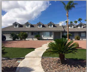
Las Vegas, N.V. Women's Home 702-386-1966