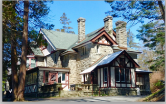
Garrison, N.Y. Women's Home & Leadership Academy 845-424-3674