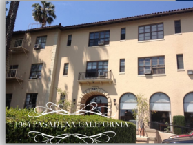
Pasadena C.A. Women's Home 626-405-0950