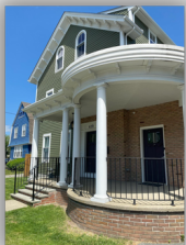
Fall River, MA Women & Children's Home 508-567-5081