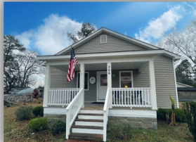
Rose Hill, N.C. Crisis Center 910-284-9342