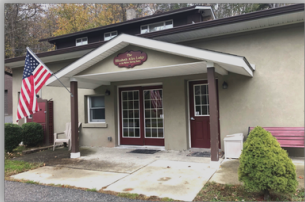
Garrison, N.Y. Women & Children's Home 914-960-6585